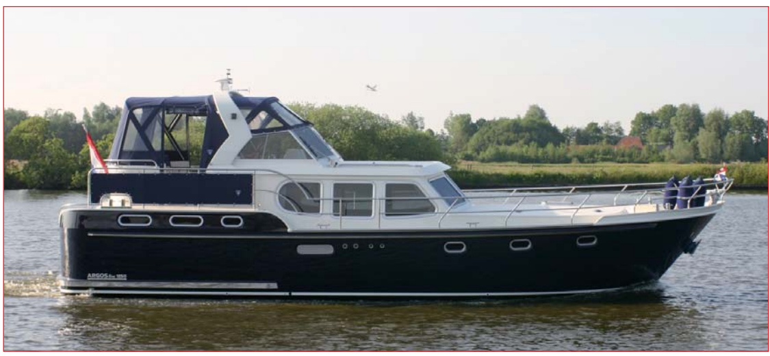
Argos-Line 1250 Argos Yachts use Ratio Electric Shore Power connections as a standard.