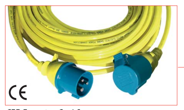
CEE Extension Cord Set