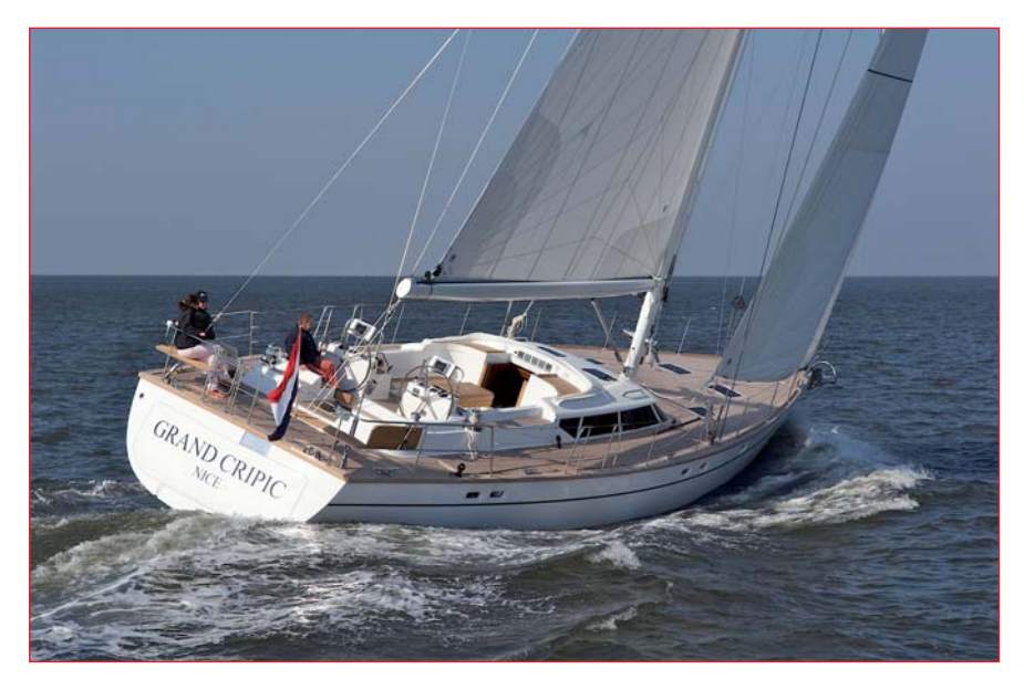
Contest 60CS Contest Yachts use Ratio Electric Shore Power connections as a standard.