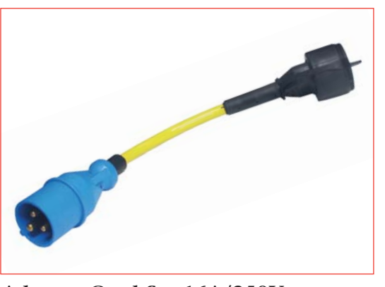
Adapter Cord Set 16A/250V