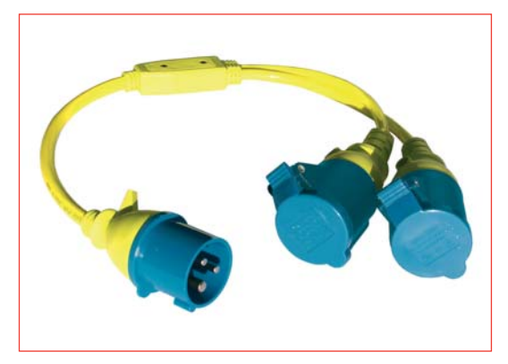
Splitter Cord Set CEE 16A/250V