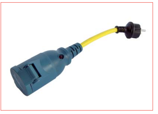
Adapter Cord Set 16A/250V