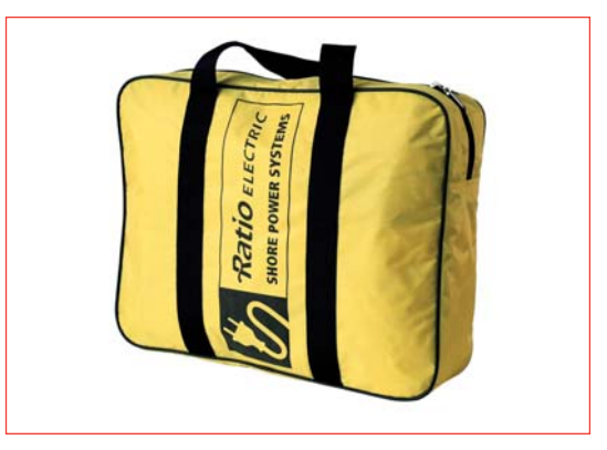
Organiser Bag • Part no. 70021