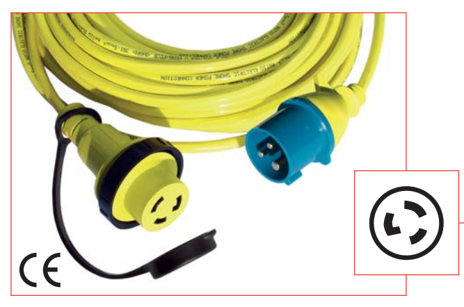
Marinco MCP16 Cord Set